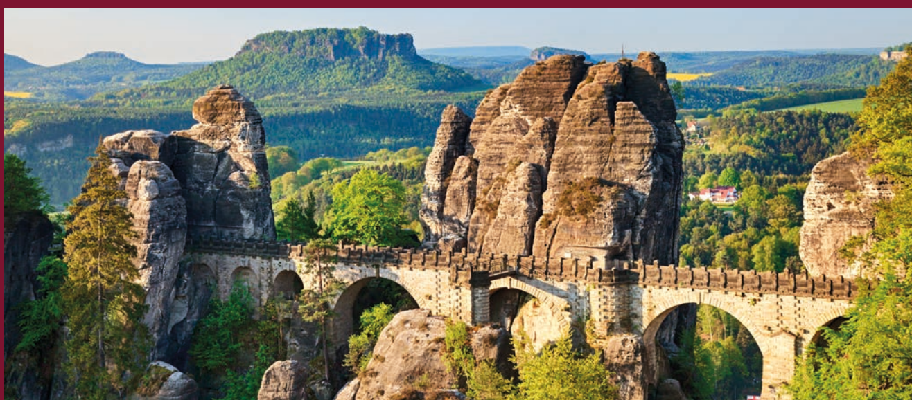
Photos: Top left – Moritzburg Castle Top right – Frauenkirche, Dresden Bottom – Bastei bridge