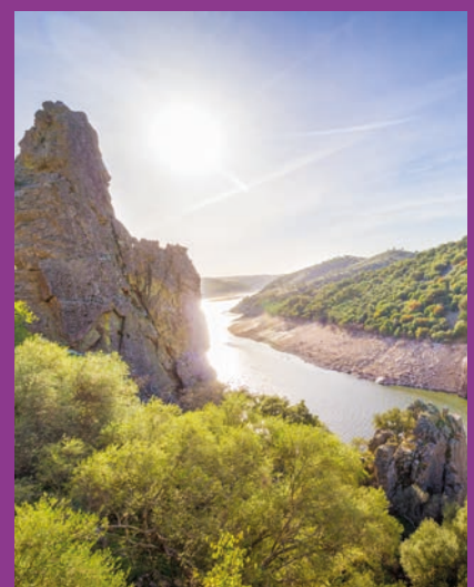
Photos: Top left – Monastery of Guadalupe, Caceres Top right – Kingfisher, Monfragüe National Park Middle right – Spanish paprika and pepper powder Bottom right – Monfragüe National Park