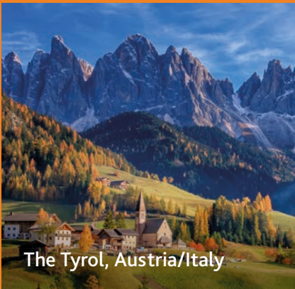
The Tyrol, Austria/Italy