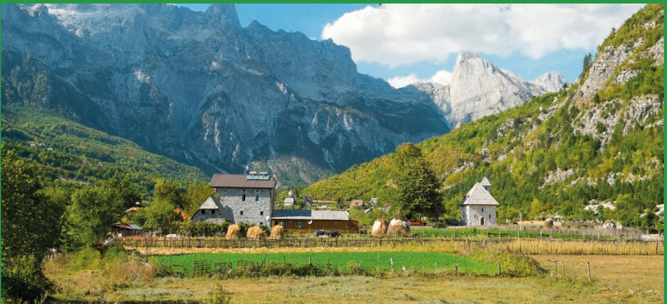
Photos: Top left – Ksamil, Albania Mussels served on skewers Top right – Saranda Bottom – Theth National Park