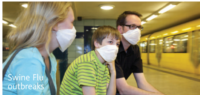
Swine Flu outbreaks