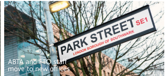
ABTA and FTO staff move to new offices