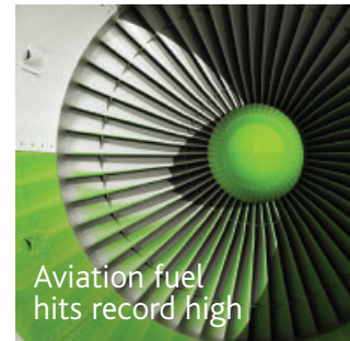
Aviation fuel hits record high